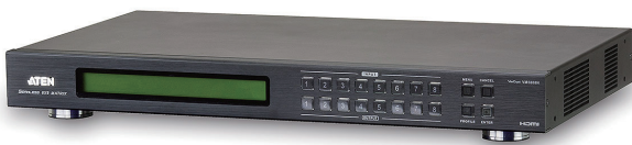
VM5808H Front view